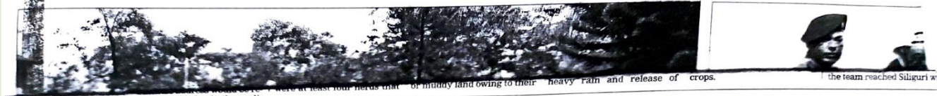
At least four farms that of muddy land owing to their heavy rain and release of crops. The team reached Siliguri w

required for it," said a source in the department. The decision, which will be into effect from November 4 according to the order, is aimed at encouraging commercial activities across Bengal so that jobs are created even in remote areas.